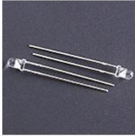
3mm IR LED