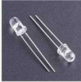
5mm IR LED