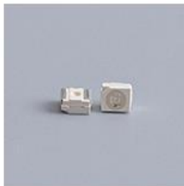
SMD 3528 IR LED