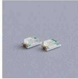
SMD 0603 IR LED