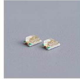
SMD 0805 IR LED