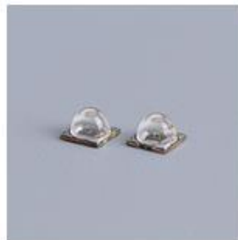
SMD 3535 IR LED