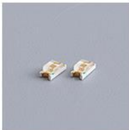
SMD 1206 IR LED