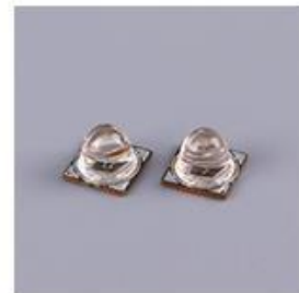
SMD 4040 IR LED